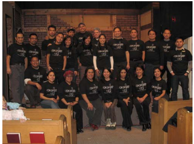
ACTS Cast and Crew after first drama presentation "Away from the manger" last Dec. 16, 2007

For more details please contact Gina Montemayor at (905)-686-1890 or Arnold Mendoza at (416) -724-4432.